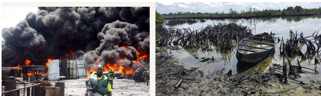
Figure 5: The hazards of bombing illegal refineries and incessant oil spills on marine lives and habitats

Myriad security threats have increasingly afflicted vital global sea lanes and now severely undermine stability closer to Nigerian shores (Mejia Jr., 2003). Key contemporary risks centre around piracy, hijacking, kidnapping, oil theft, and cyber hacking targeting commercial ships, port infrastructure and offshore platforms (Ogbonnaya & Nwaorgu, 2019). Costs from maritime crime worldwide now exceed billions of dollars annually and the forecast trends point higher without interventions to reverse the tide. As indicated in Figure 5, the military fierce intervention of using kinetics and bombing of illegal refineries have grossly polluted the environment with noxious liquids and gases, damaged marine habitats and vegetations, and killed aquatic lives. This adversely affects the prospects of harnessing a sustainable blue economy.