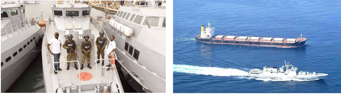
Figure 7: NN Offshore Patrol Vessel (OPV). in action at sea

Armed with the Suppression of Piracy and other Offences Act of July 2019 and working in conjunction with the NN, NIMASA acted swiftly in foiling a pirate's attack on a Chinese fishing vessel off the Nigerian coast in June 2020 using an NN - OPV. Ten of the pirates were arrested, tried by a Federal High Court, and sentenced to 48 years imprisonment each, to serve as deterrent to other maritime criminals. In a similar incident, a Chinese fishing vessel, MARINE 707 with 51 crew members which included 48 Ghanaians and 3 South Koreans was interdicted by the NN on the 18 th of May 2021, operating illegally in the GoG. The vessel and her crew members were promptly arrested and handed over to the Ghanaian and South Korean Authorities for further investigation and action. Tranquillity on our waterways is sine qua non to the growth and development of the nation's blue economy.