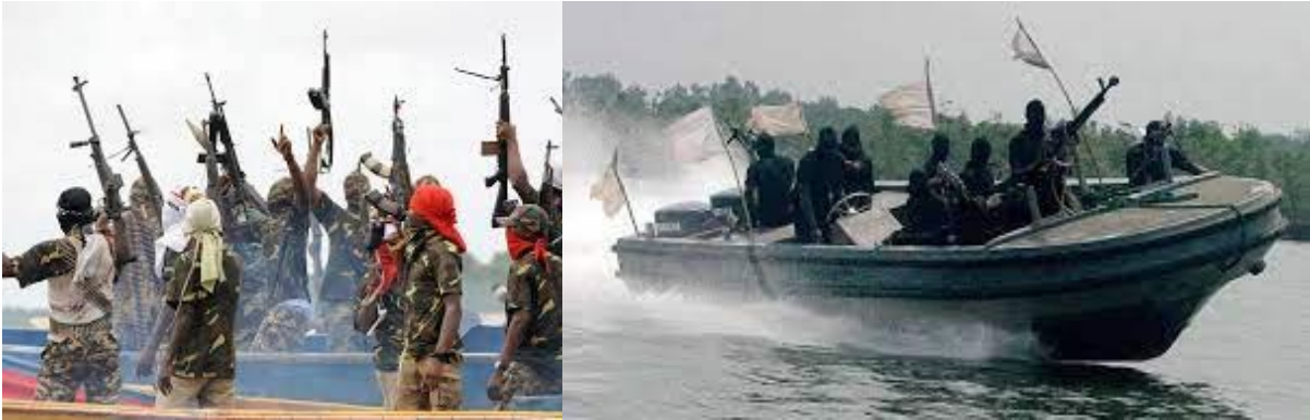
Figure 2: Maritime Piracy Attacks

armed robbery attacks on vessels and their crew, etc. All of these have posed monumental challenges to the development of the global maritime industry. This article analyses the escalating maritime security challenges Nigeria faces and their deepening impacts on national development ambitions. Assessment spotlights economic repercussions across ports, shipping fleets, and offshore oil infrastructure as maritime crimes escalate.