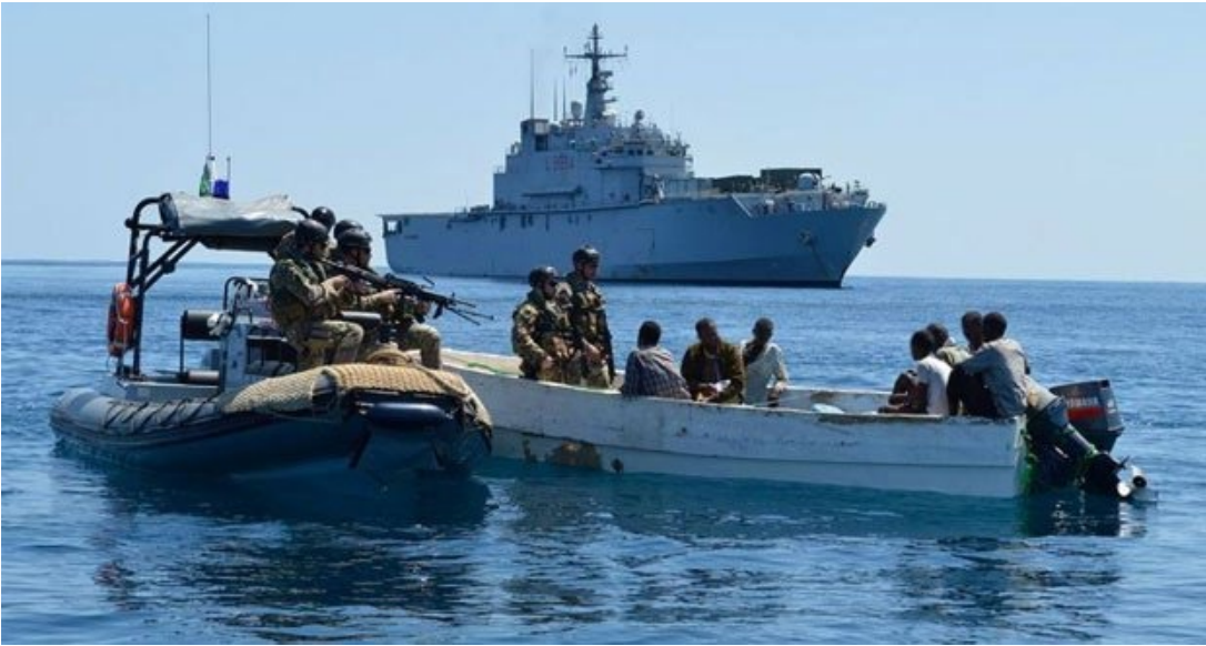
Figure 3: Naval gunboat stops a Pirate Attack in the GoG

Strategic analysis further examines the naval and coast guard protection roles and coordination with the maritime safety agency alongside international partnerships within the region. Collectively, findings underscore the imperative of upgrading naval capacity and law enforcement operations, strengthening inter-agency coordination, and employing comprehensive ship security protocols as vital to stabilizing Nigeria’s maritime sector and restoring an environment conducive to sustainable prosperity.