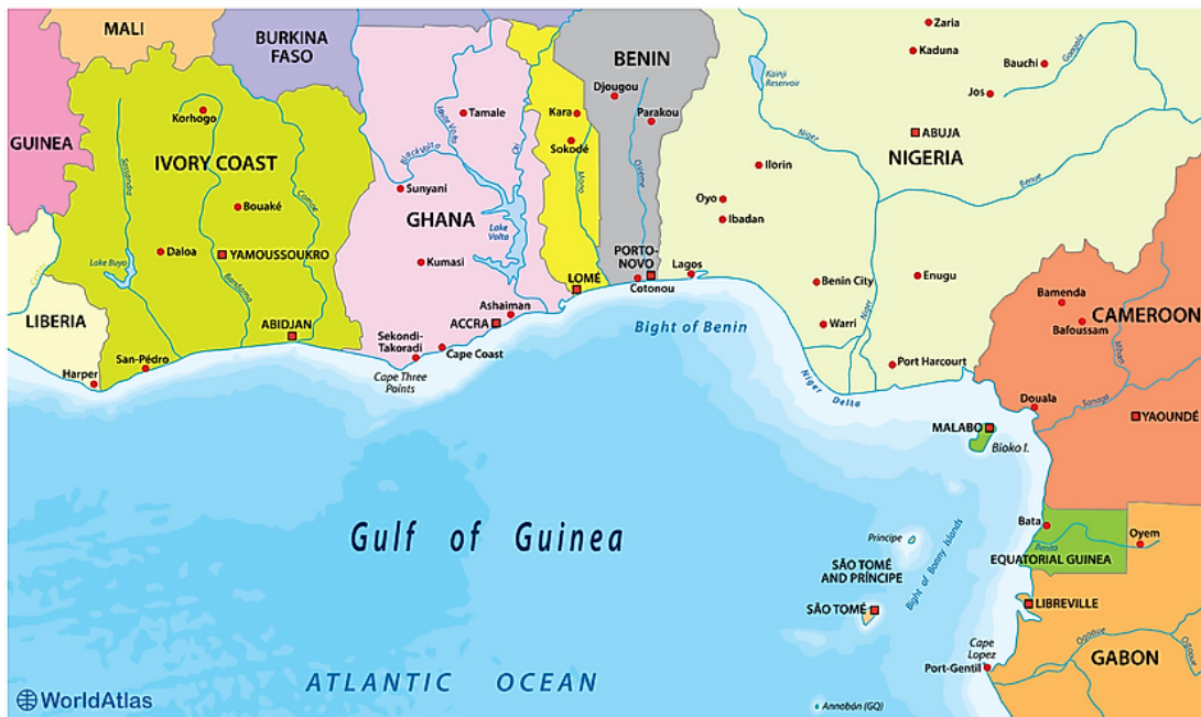
Figure 1: Map showing countries making up GoG

Blessed with a robust coastline spanning about 853 nautical miles (from Badagry in the Southwest to Calabar in the Southeastern fringes) and a labyrinth of navigable Inland Waterways stretching for about 3,000 kilometres all emptying into the vast Atlantic Ocean. Nigeria commands about 70% of trade and commerce in the sub region as shown in Figure 1, a position that also bequeaths her with enormous responsibilities in the realm of maritime security in the Gulf of Guinea (GoG). Located at the heart of the GoG which stretches from Senegal to Angola in the Southern part of Africa, Nigeria, among the maritime nations in the region, has had her fair share of challenges in the quest to create an enabling environment for her maritime trade to thrive. Cardinal among these is the issue of insecurity across her channels and water ways.