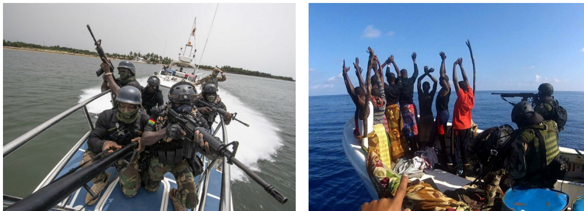
Figure 6: Maritime criminals robbing and kidnapping commuters at sea

The GoG has become an epicentre of intensifying international piracy alongside Niger Delta militancy affecting onshore energy infrastructure. In 2020 alone the region recorded 84 attacks and 135 crew kidnappings for ransom - exceeding the combined global total elsewhere (Atakpa, 2023). And signs in 2023 show further spikes as foreign gangs and local insurgents capitalize on turmoil amid limited deterrence. Figure 6 displays maritime criminals operating in the GoG.